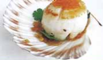
SEARED HOKKAIDO SCALLOPS IN 1/2 SHELL WITH ROASTED PEANUTS, SMOKED TROUT, CORIANDER & NAHM JIM