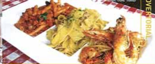
Bellissimo Cucina & Trattoria Docklands Drive, Waterfront City Ph 9326 6636 www.bellissimo.net.au

Bellissimo's wine list features a variety of reasonably priced Australian wines, together with some Italian offerings,